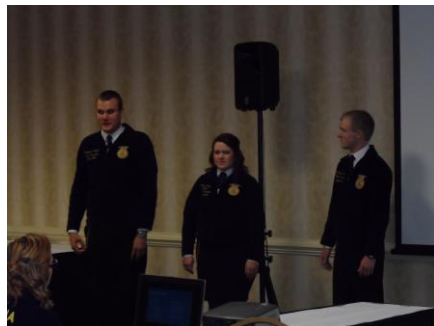
VA FFA State Officer Presentation