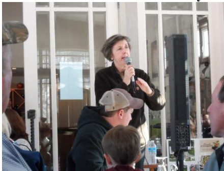
Albermarle Cider Works