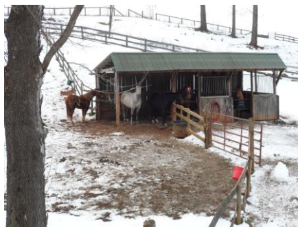
Brookhill Farms — Horse Facility