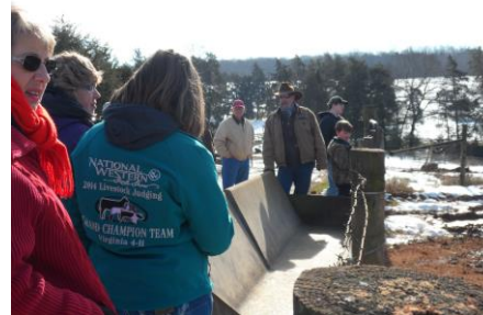
C-Stock Angus Farm