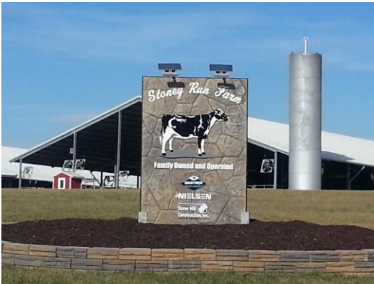
Stoney Run Farm