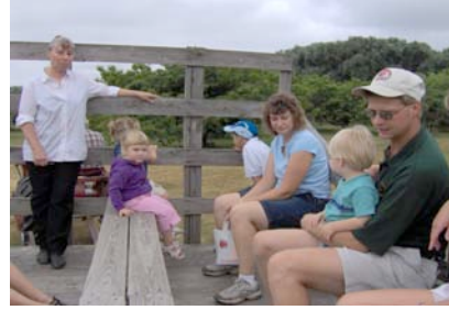
Welcome to Canada!